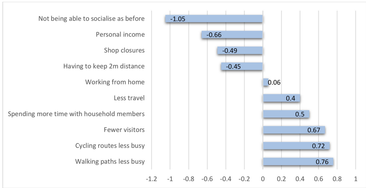
FIGURE 1 Life during lockdown for locals in Snowdonia National Park (Spring 2020): Positive and negative aspects