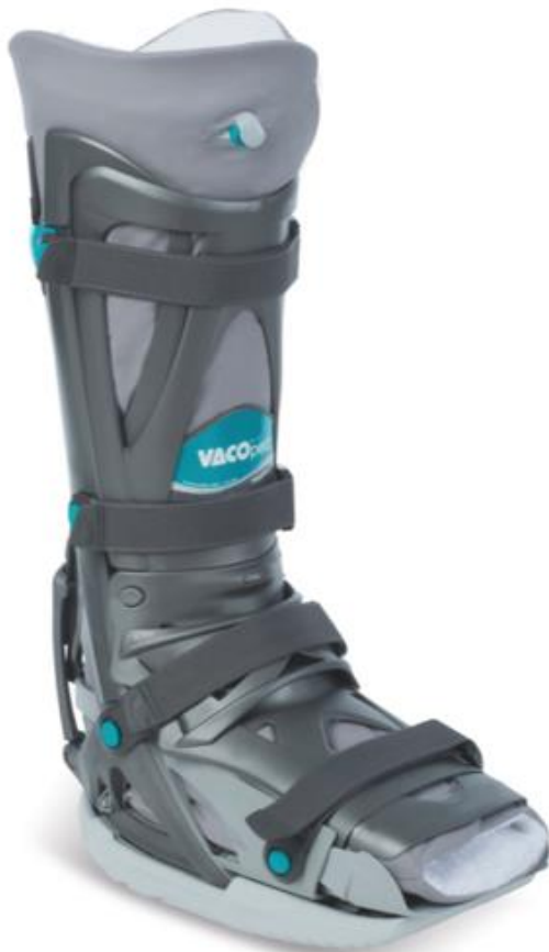
Figure 1. VACOPed boot