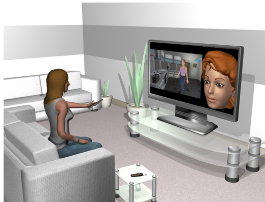
Fig. 1. Affective Interactive Narrative installation.

The system can now be described as comprising i) an interactive narrative using traditional plan-based generative techniques, which is able to create situations exhibiting different levels of tension or suspense (by featuring the main character in dangerous situations) ii) an expressive virtual character (implemented using the Greta system [4]) whose role is, by accessing the internal data of the narrative planner to exaggerate the emotional value of a given scene so as to make it more visible to the user and iii) affective input devices, which at the current stage of development of the system are limited to an affective speech detection system (EmoVoice [5]) and a multi-keyword spotting system detecting emotionally charged words and expressions.