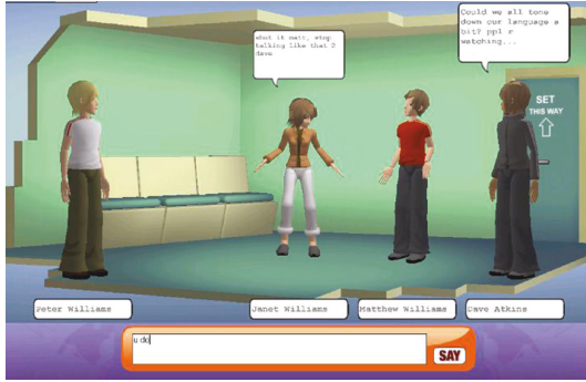
FIGURE 2: Emotional animation and the AI character.