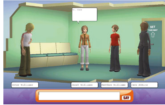
FIGURE 1: Emotional animation.

The approaches we have taken provided some flexibility in the processing and recognition of metaphorical expressions. However, our processing could also be challenged by various variations of these several language phenomena (e.g., “I couldn’t bear to touch the memories”, “he felt his anger rising step by step”, “he was red with anger. I could see the smoke coming out of his ears”, “she was filled