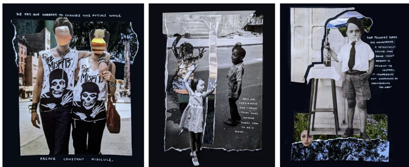
Figure 3 Emotion and Experience has Contributed to Diverse Concepts and Ideas.

Although NCL-FAD faced a year of challenges due to Covid restrictions, this cohort continued to reflect the successes of previous NCL-FAD student progression. All students applying through UCAS were offered places on degree programmes, with the majority securing offers from first choice universities. Each year, a small minority of students choose not to progress to HE, with some seeking apprenticeships where possible or taking a 'gap year'. This year, approximately six from a cohort of 87 students chose not to pursue an undergraduate degree,