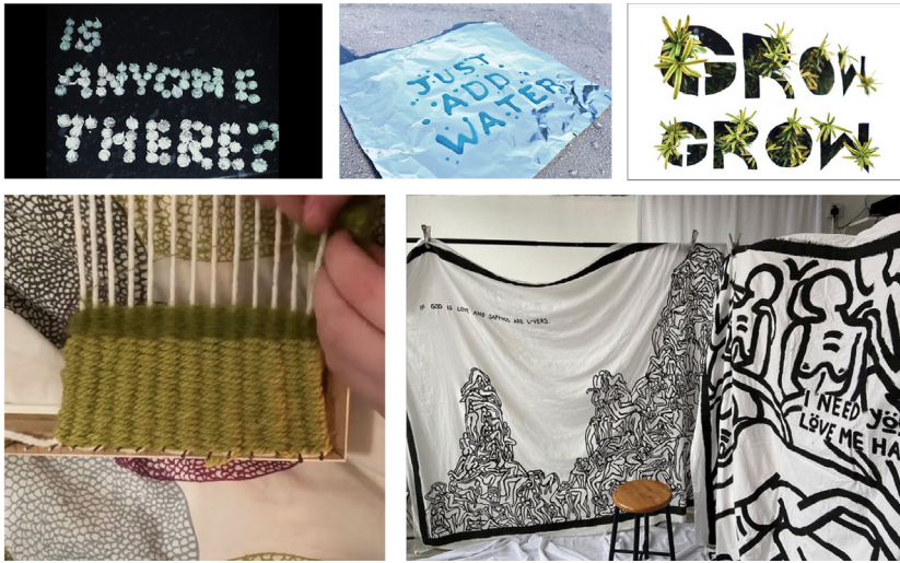
Figure 1 Student Experimentation with Media, Methods and Materials.

a form of 'disciplinary property' (Cousin 2006), allows students to recognise there are multiple ways to solve problems. The latter also reflects the troublesome characteristic in that there is ambiguity and uncertainty where there are multiple perspectives with no right or wrong answers. Whilst some experimentation with media, materials and methods was naïve and literal, these are still small victories in creative experimentation and represent a heuristic approach to learning.