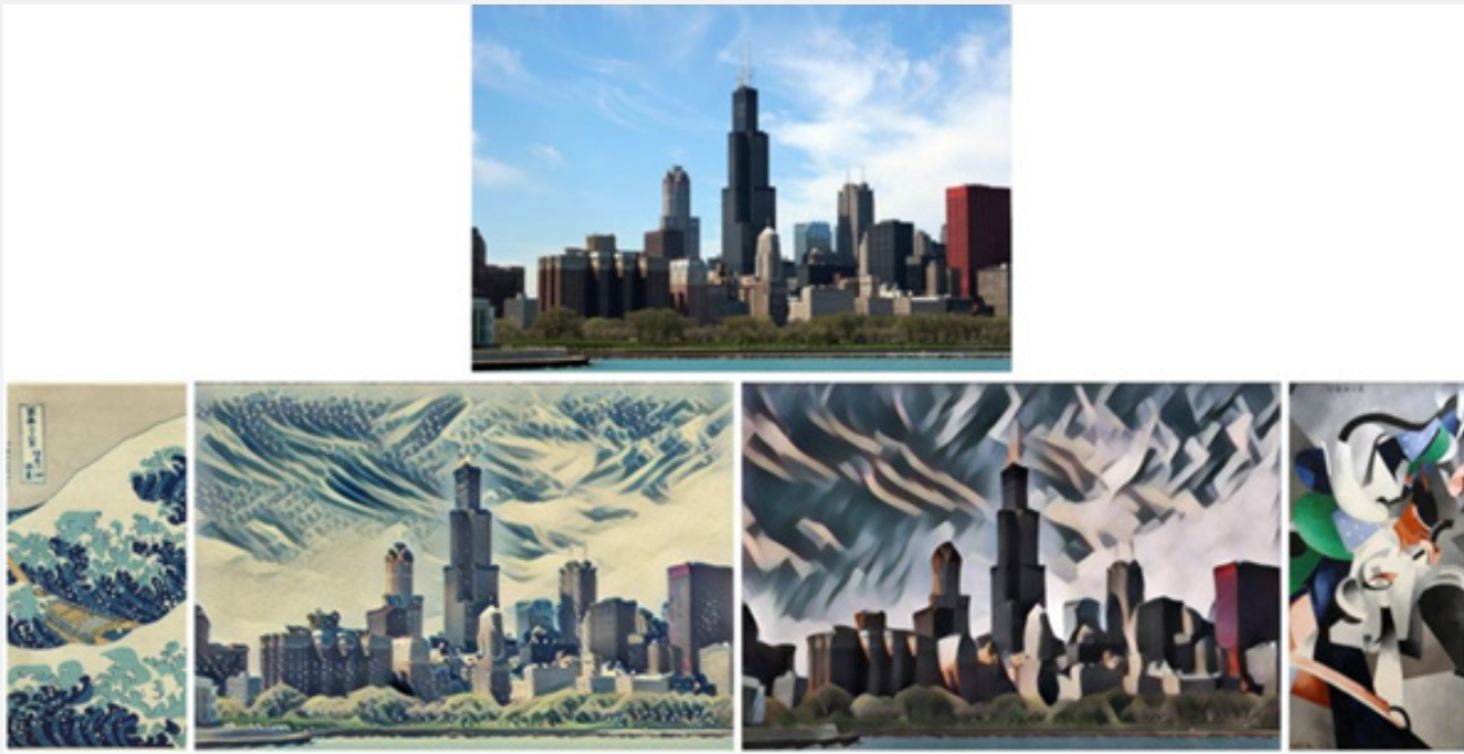
Figure 1: Lengstrom Fast style transfer examples: Left Katsushika Hokusai's The Great Wave, Right Francis Picabia's Udnie [16].